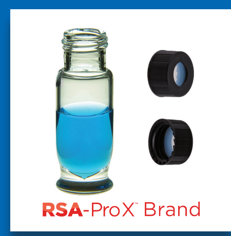
Catalog No. 9512S-1DCP-PX Vial Kit, 1.8ml Clear Screw Top RSA-Pro X™ Max Recovery Vials & AQR™ Screw Caps with non-slit Septa, 100/PK