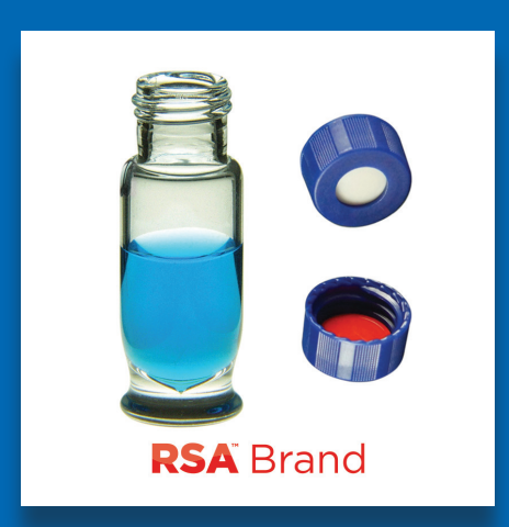
Catalog No. 9512S-1ECP-RS Vial Kit, 1.8ml Clear Screw Top RSA™ Max Recovery Vials & Soft-Guard™ Screw Caps with non-slit Septa, 100/PK