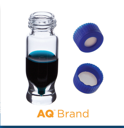
Catalog No. 9512S-1CP-T Vial Kit, 1.2ml Clear Screw Top AQ™ MRQ™ Vials & AQ™ Screw Caps with non-slit Septa, 100/PK