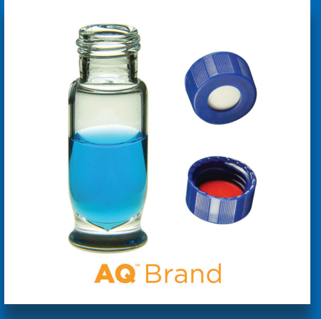
Catalog No. 9512S-1ECP Vial Kit, 1.8ml Clear Screw Top AQ™ Max Recovery Vials & Soft-Guard™ Screw Caps with non-slit Septa, 100/PK