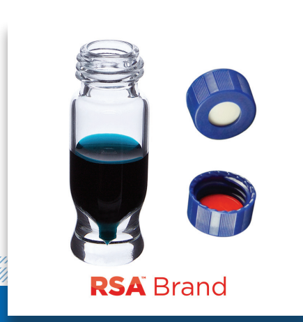
Catalog No. 9512S-1EMP-RS Vial Kit, 1.2ml Clear Screw Top RSA™ MRQ™ Vials & Soft-Guard™ Screw Caps with non-slit Septa, 100/PK