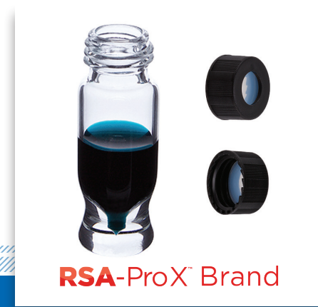
Catalog No. 9512S-1DMP-PX Vial Kit, 1.2ml Clear Screw Top RSA™ MRQ™ Vials & AQR™ Screw Caps with non-slit Septa, 100/PK